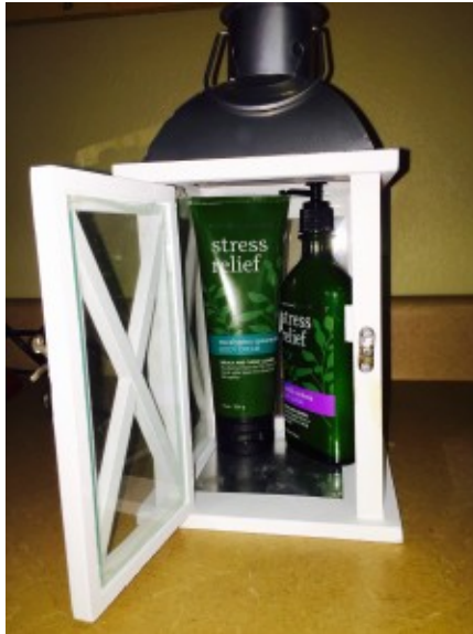
Lantern with Gift Inside