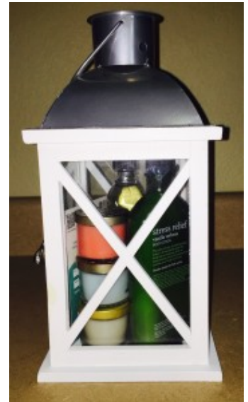
Lantern with Gift Inside

Lastly, I placed the gift card in the front! Didn't this turn out great?! I love it! Just tie a cute bow around the lantern, write a sweet card and you're done!