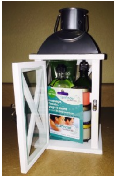
Lantern with Gift Inside

Lastly, I placed the gift card in the front! Didn't this turn out great?! I love it! Just tie a cute bow around the lantern, write a sweet card and you're done!