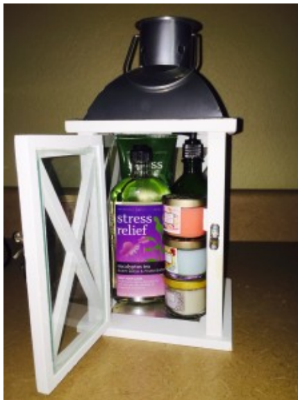
Lantern with Gift Inside

I taped the bottom of the objects to make sure they would stay put!